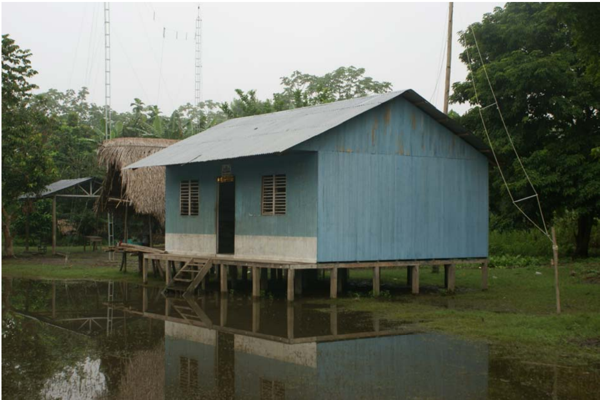
Fatima village clinic

This afternoon the medical team attended seven children with conjunctivitis in the village of Iparia where we are docked for a night.