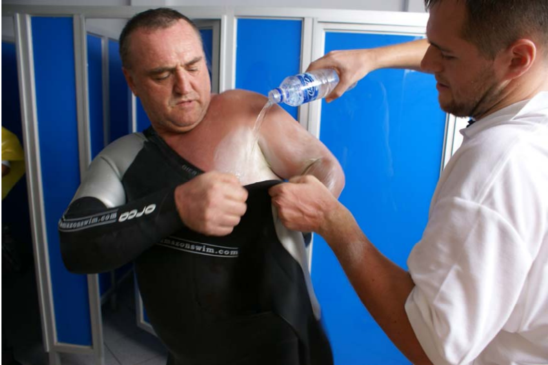
First sun burn