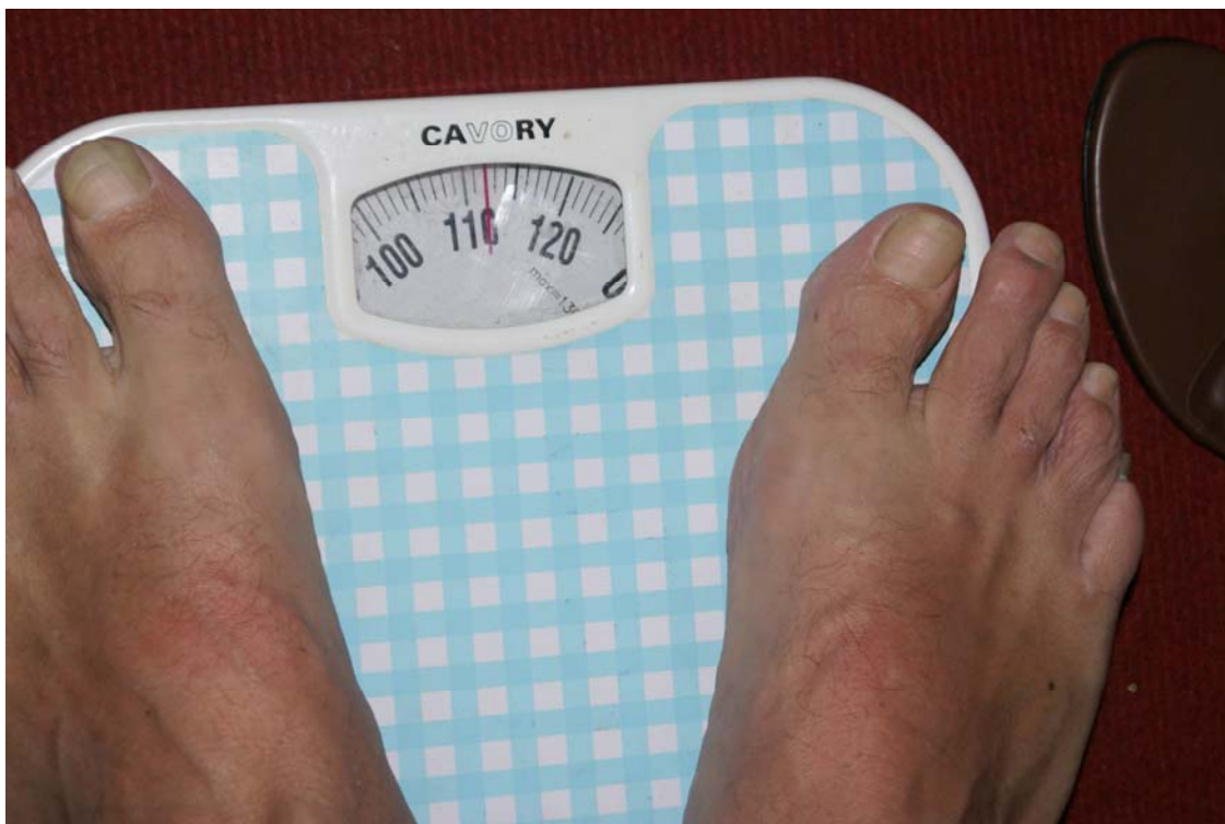
Martin's face after 120 km of swimming